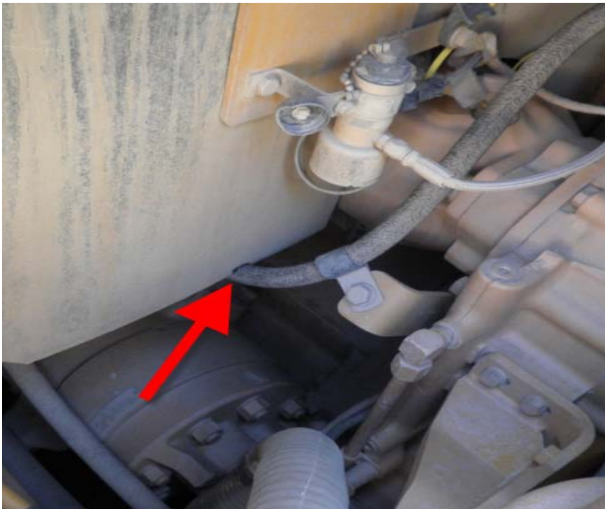
Figure 2 example of poorly routed fuel line.